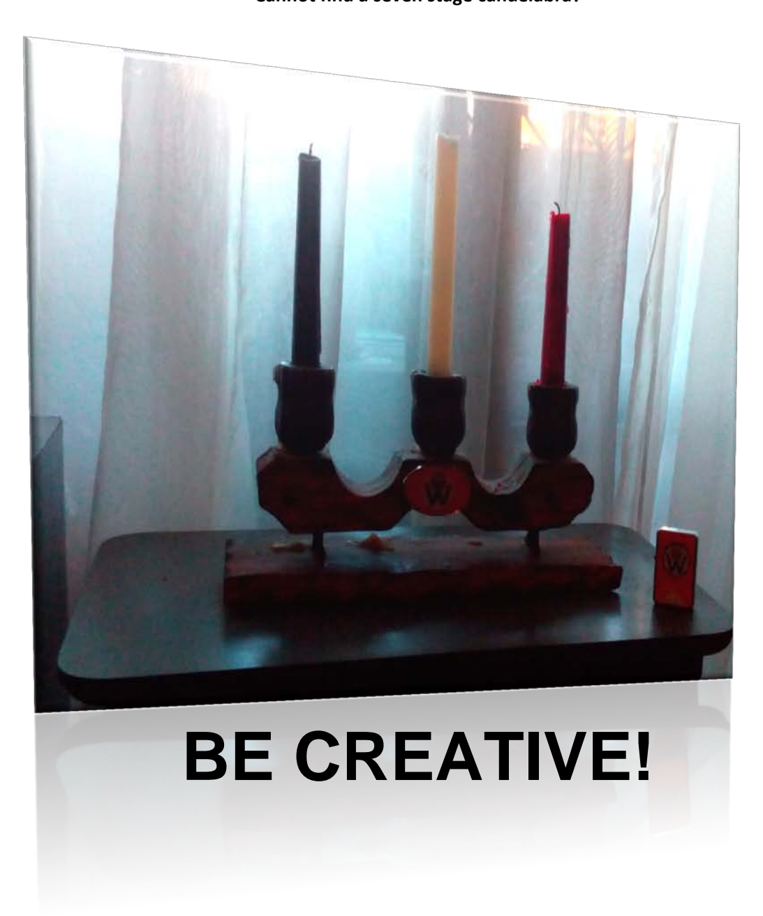
Don't have seven candles? Cannot find a seven stage candelabra?