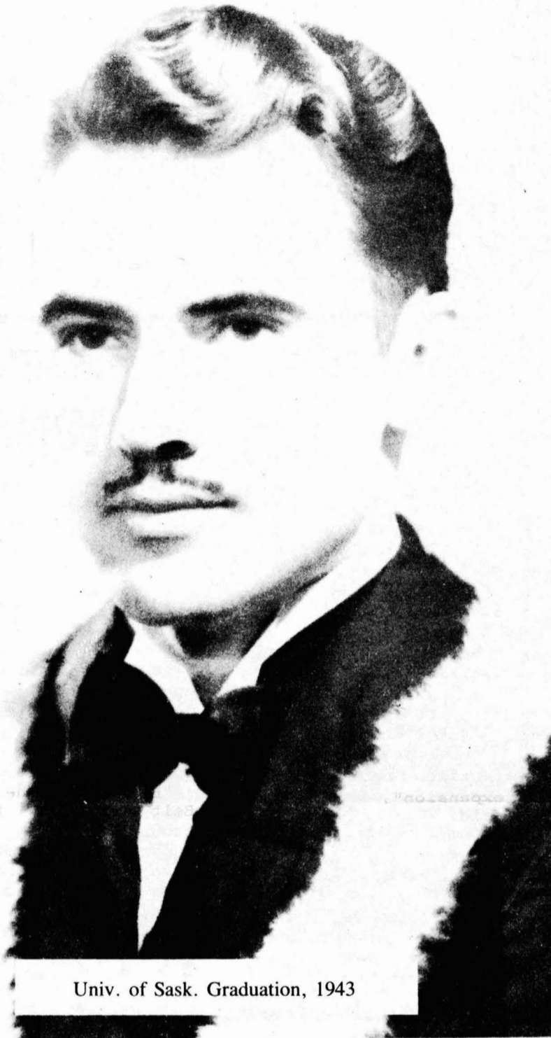
Univ. of Sask. Graduation, 1943