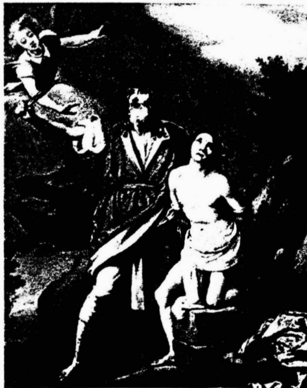
"Abie Sacrificing Ikie For Yahweh"

The pages of Jewish history are stained with the blood of White children, many of these hapless victims butchered in the most grotesque, barbaric fashion imaginable. The two salient Jewish feast-days concomitant with ritual murder have been Purim and Passover, the former festival celebrated annually in February or March, and the latter at Easter. When a ritual murder is performed at Passover, the victim is usually that of a child under the age of seven, who is bled white, stabbed, tortured and beaten as the young life expires in an atmosphere of unmitigated horror. The blood of the young victim is drained into cups where it is used in wine and in the Massen (bread).