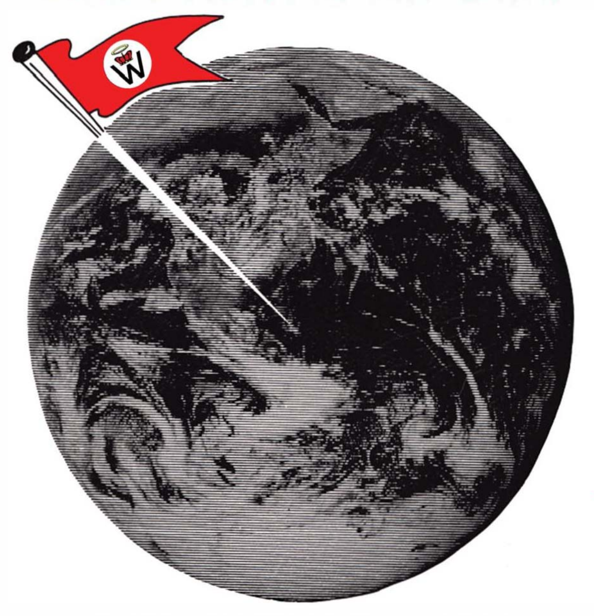
*RAHOWA! -RAcial HOly WAr (Rhymes with Aloha!)

Embodied in CREATIVITY is a Dynamic Creed and a Militant Program for the Survival, Salvation and Redemption of the White Race.