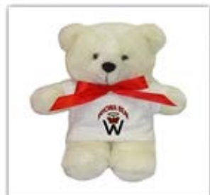
Rahowa theTeddy Bear $11.99