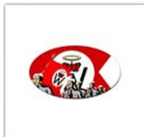
Church Stickers - Oval (10 pack) $9.99