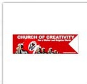
Church Stickers (10 pack) $14.88