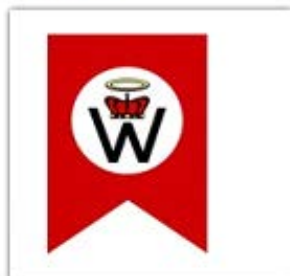
Church Flag - Large Vertical $21.00