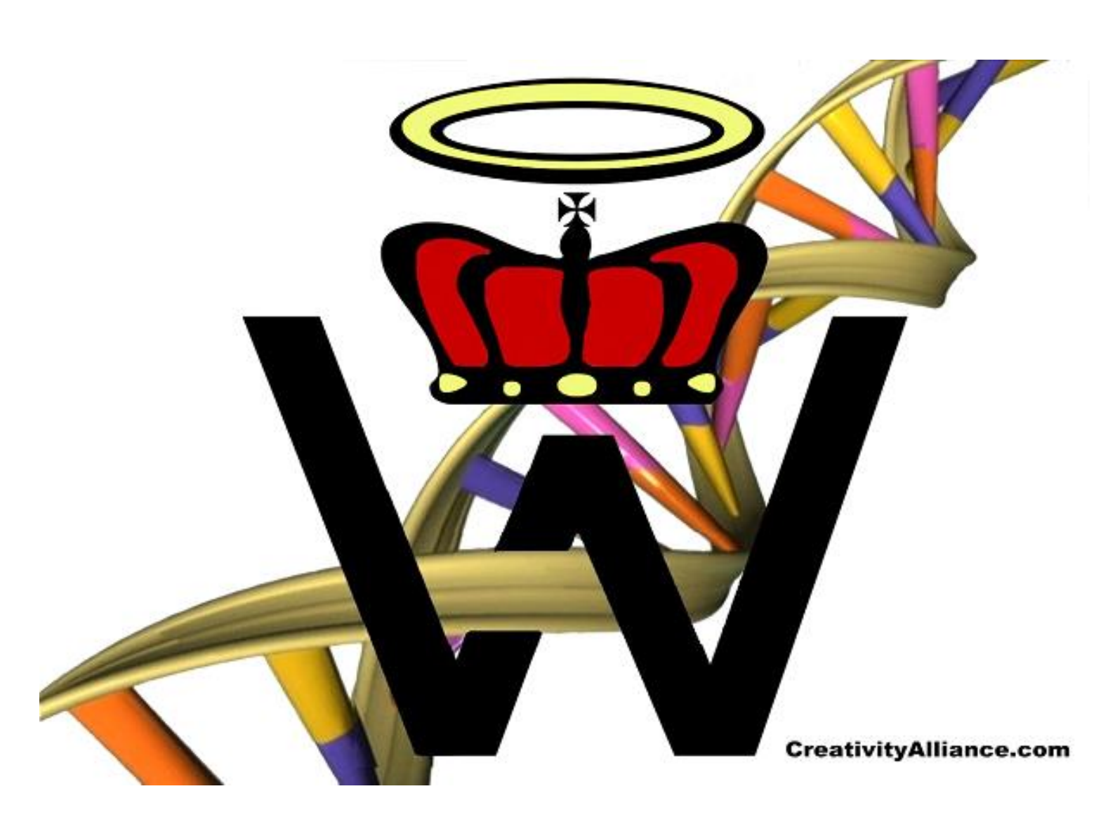
A guide for Members, Supporters and Applicants